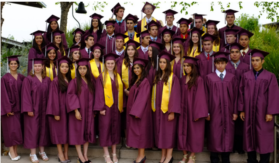
The St. Francis Central Coast Catholic High School Class of 2012 poses on the steps of Piazza Zanella

In closing she offered heartfelt thanks to parents, teachers and the whole St. Francis Community, including the Salesians, “who instilled in us strong faith and the desire to love and accept everyone, in the true image of Don Bosco. And thanks, of course, to our Lord, Jesus Christ, whom we have come to know and love deeply and fervently in our time at St Francis.”