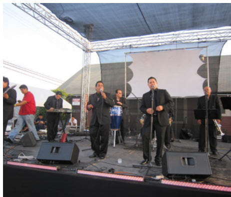
Famous Sonora Santanera