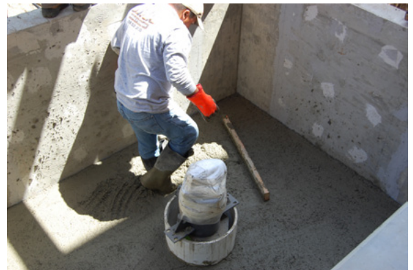
Concrete finisher spreads concrete – elevator pit