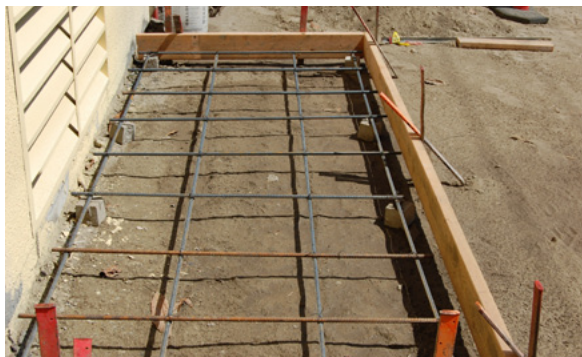
Formed AC pad ready for concrete

Arcadia Glass Company installed half the windows with screens on the north side of the building. They look very good. The glazers finished sealing the windows on the south by installing mineral wool installation in-between the two window frames and then closing the space with an aluminum panel.