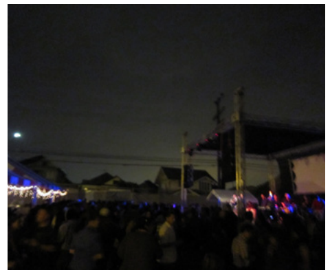
The dance at its best!