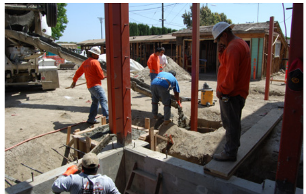
Pouring concrete around the canopy columns