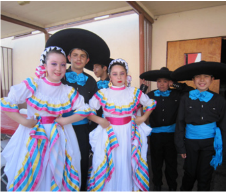
Our Youth Folklorico