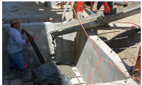
Pouring the concrete elevator pit floor