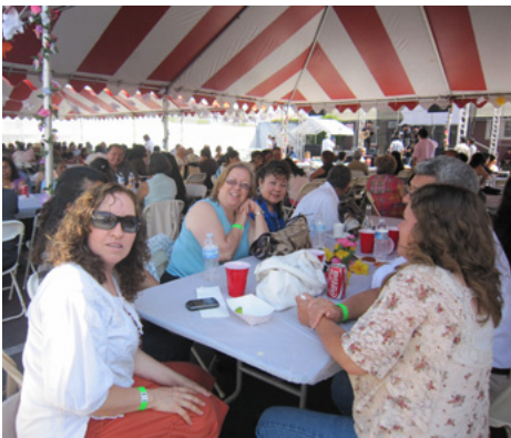
Some parishioners having a good time