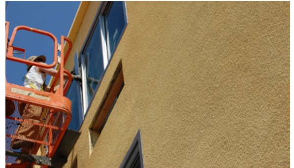
Window glazer install installation and aluminum panel.