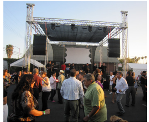
The dance just beginning