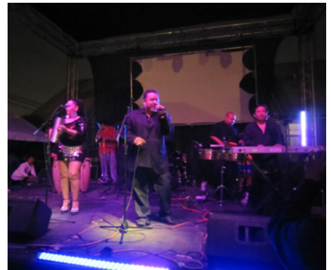
Famous Sonora Dinamita