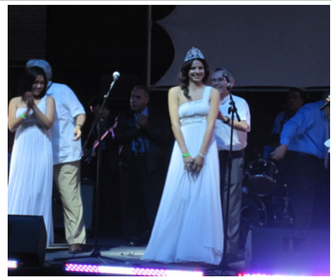
Our Spring Queen 2012